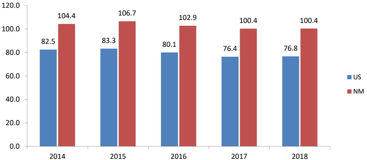
Figure 2. Per Capita Income of Lincoln County as a Percent of U.S. and New Mexico (2014-2018)

Total employment in Lincoln County in 2018 was 10,687, with an increase of 1.16 percent from 2014 to 2018. Lincoln County’s increase in employment was lower than the increase in employment experienced by the state (2.93) and the increase of 7.79 percent in the nation’s total employment. Additionally, in 2018 the employment to population ratio in Lincoln County was 0.55, compared to the state ratio (0.53) and the nation (0.61).