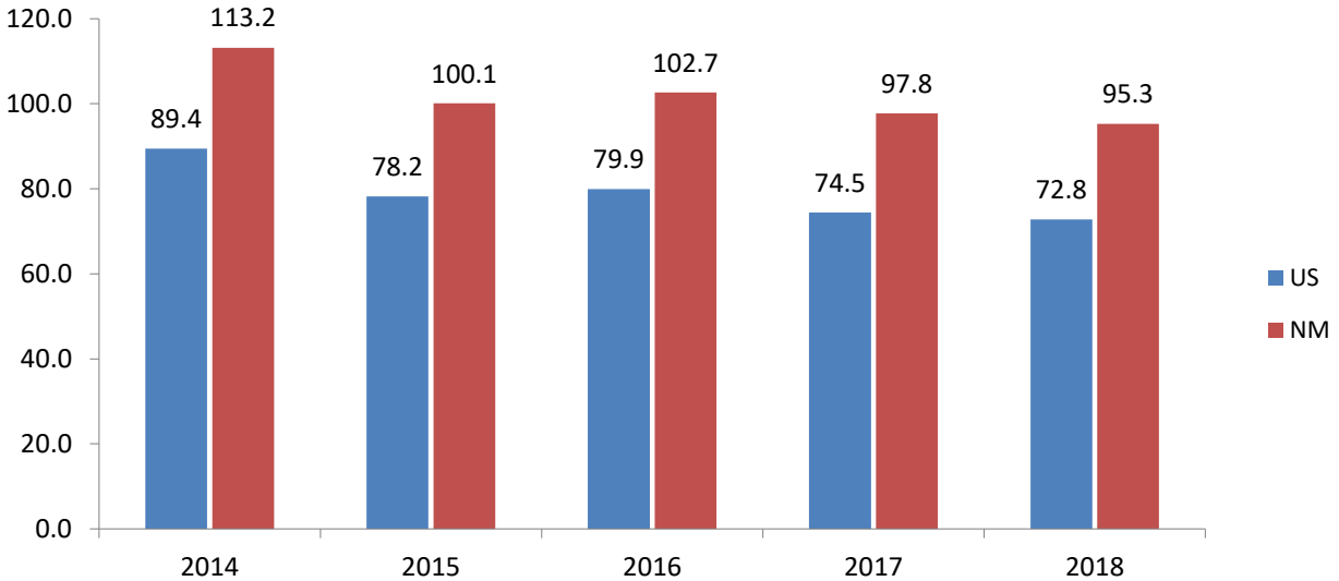
Figure 2. Per Capita Income of De Baca as a Percent of U.S. and New Mexico (2014-2018)

Total employment in De Baca County in 2018 was 940. Between 2014 and 2018, total employment in De Baca County decreased by 7.11 percent, significantly lower than the state which had an increase in employment of 2.93 percent and the nation which had an increase of 7.79 percent. The De Baca County employment to population ratio was 0.53, compared to the state (0.53) and nation (0.61).