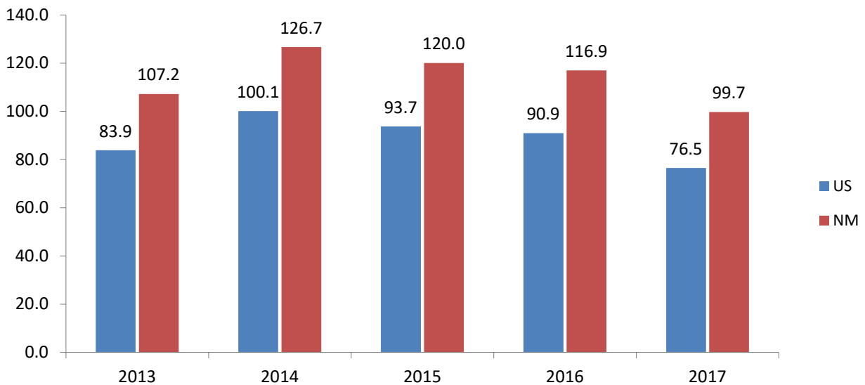
Figure 2. Per Capita Income of Harding as a Percent of U.S. and New Mexico 2013-2017

Per capita personal income for Harding County in 2017 was $39,588, ranking 10 th in the state. Per capita income for Harding County was 99.70 percent of the corresponding state figure of $39,709 and 76.53 percent of the national average of $51,731 (See Figure 1 and 2). Between 2013 and 2017, the growth rate of per capita income in Harding County was 5.25 percent. This growth rate was substantially lower compared to the state growth rate of 13.21 percent and the nation’s growth rate of 15.34 percent for the same period.