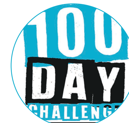
Innoventure Camp 2021