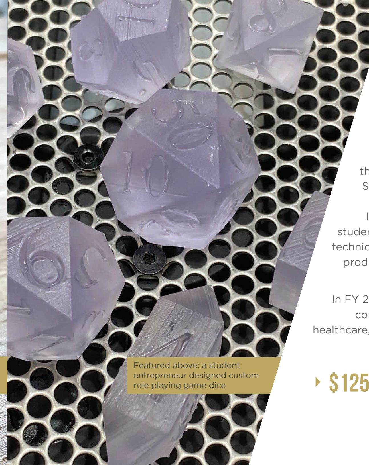
Featured above: a student entrepreneur designed custom role playing game dice

Through FIX Product Design Awards, ventures in the Borderplex region receive no-cost access to product design/ prototyping equipment, and to the electrical and mechanical engineering expertise that is crucial to product development. Services are provided through NMSU’s Aggie Innovation Space prototyping laboratory, which makes accessible to students, faculty, and community members technical resources and know-how to create product prototypes, hone product design, and address technical challenges.