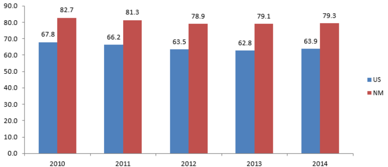
Figure 2 : Per Capita Income of Valencia County as Percent of U.S. and New Mexico, 2010-2014

Total employment in Valencia County was 21,069 in 2014. Total employment in Valencia County decreased by 3.41 percent between 2010 and 2014 compared to the increase experienced statewide (2.20 percent) and nationwide (7.38 percent). The Valencia County employment to population ratio in 2014 was 0.28. New Mexico's 2014 employment to population ratio was 0.52 and the nation's ratio was