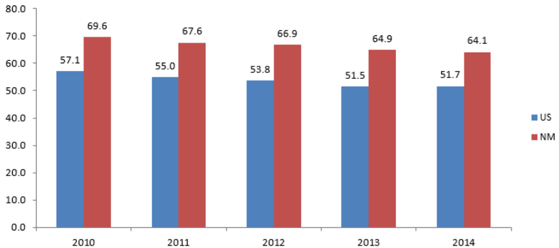
Figure 2 : Per Capita Income of McKinley County as Percent of U.S. and New Mexico, 2010-2014

Total employment in McKinley County was 29,201 in 2014. Between 2010 and 2014, total employment for McKinley County decreased by 7.88 percent, compared to the New Mexico’s 2.20 percent growth and the nation’s employment growth of 7.38 percent. The employment to population ratio for McKinley County was 0.40, significantly lower compared to the state 0.52 and nation’s ratio 0.58. This ratio represents a low rate of population being employed.