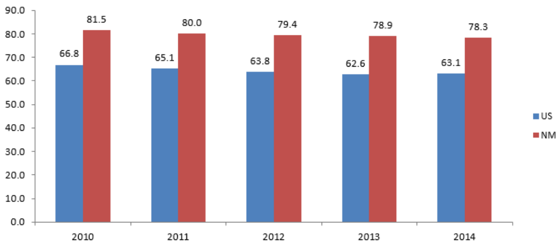
Figure 2 : Per Capita Income of Luna County as Percent of U.S. and New Mexico, 2010-2014

Total employment for Luna County in 2014 was 10,021. Between 2010 and 2014, total employment in Luna County decreased by 1.0 percent compared to the state's employment, which increased by 2.20 percent while national employment increased by 7.38 percent. The employment to population ratio for Luna County in 2014 was 0.41 significantly lower, compared to state ratio (0.52) and nation's ratio (0.58). This ratio represents a low population rate being employed.