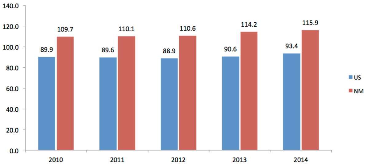
Figure 2 : Per Capita Income of Curry County as Percent of U.S. and New Mexico 2010-2014

Total employment in Curry County in 2014 was 26,855. Between 2010 and 2014, total employment in Curry County increased by 6.75 percent, while the state had a 2.20 percent increase and the nation had an increase of 7.38 percent in employment. The Curry County employment to population ratio was 0.53, compared to the state ratio (0.52) and the national ratio (0.58).