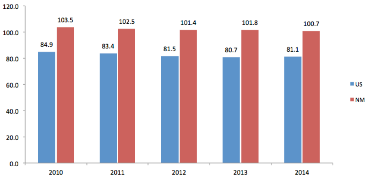
Figure 2 : Per Capita Income of Albuquerque MSA as a Percent of U.S. and New Mexico 2010-2014

Total employment in the Albuquerque MSA in 2014 was 487,905. Total employment in the Albuquerque MSA increased by 1.11 percent between 2010 and 2014—a rate of growth lower than that